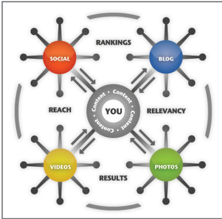
Illustration by Twelve Horses