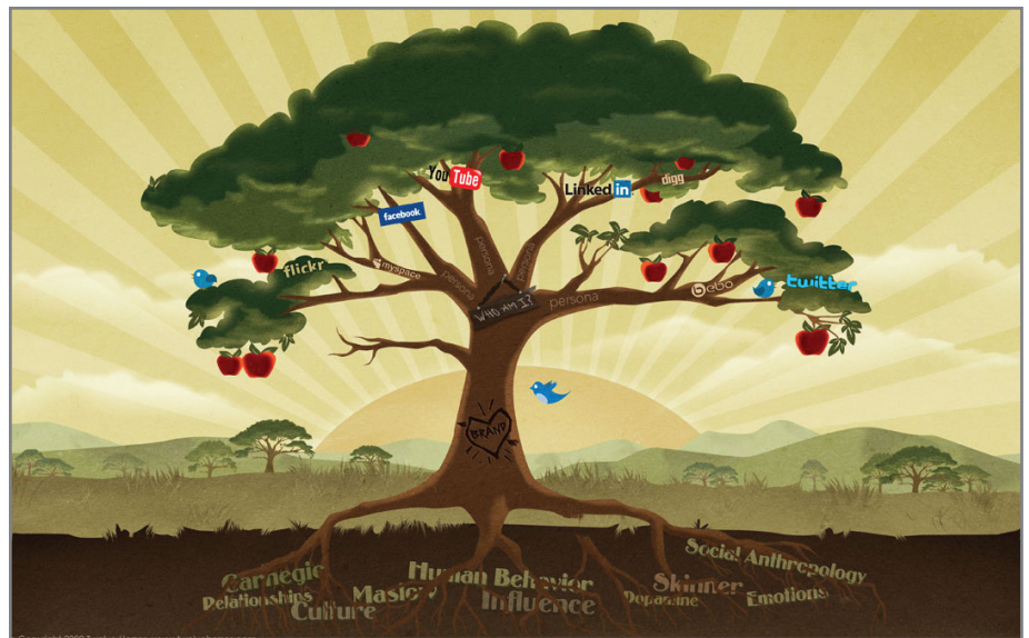
Illustration by Twelve Horses

Once we have determined what type of social marketing strategy is right for you, we begin by building your identity. We carefully select the appropriate social networks where you will have the most success in distributing content and establishing relationships with customers.